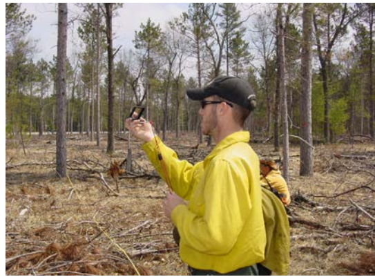
Figure 2. Sighting the azimuth for the transects.