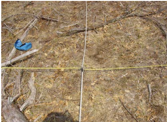
Figure 3. Lay out of four transects at 90° angles.