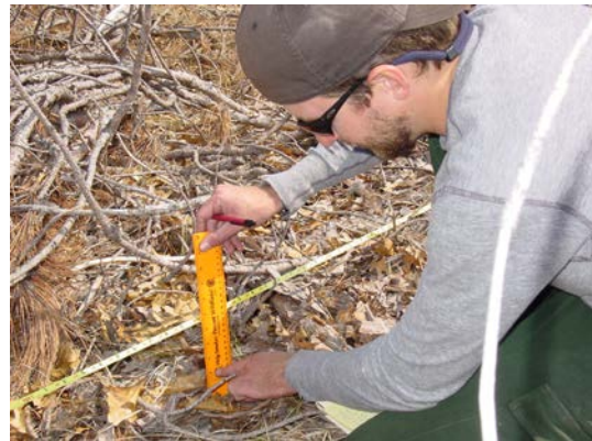
Figure 4. Using a ruler to measure duff and litter.