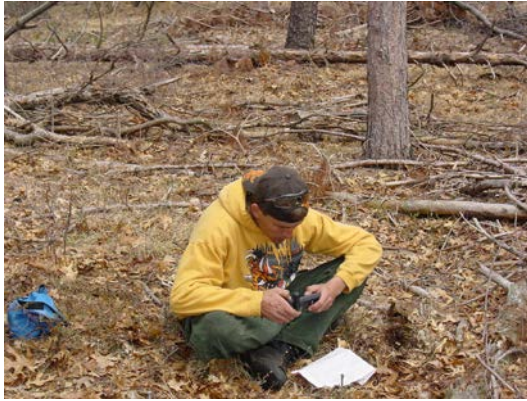
Figure 1. Recording the coordinates of plot center and determining route to next plot.